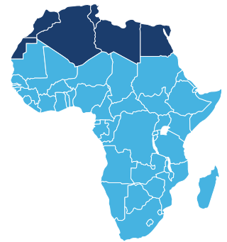
Fellows come from all 49 countries in Sub-Saharan Africa.